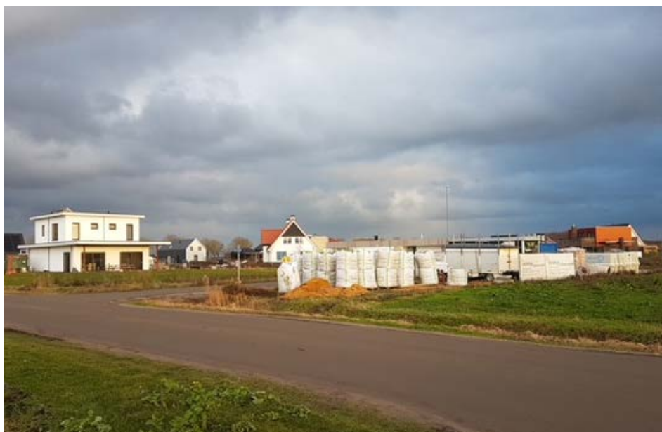
FIGURE 6 Future inhabitants of Almere Oosterwold not only develop their own houses but have also been responsible for the development of their own wastewater treatment and the development of roads. .

those with high financial, cultural, or creative capital (Nio, 2021) This does not bode well for diversity and inclusion. In practical terms, being able to design a plot and build on your own, requires capacity or time, or failing that, at least the funds to engage experts (van Karnenbeek and Tan, 2019). There is therefore self-selection of potential residents. Thus, bottom-up led housing development by future residents do not necessarily counter the current trend of increased social inequalities created through the unaffordable housing market nor do they democratize housing developments.