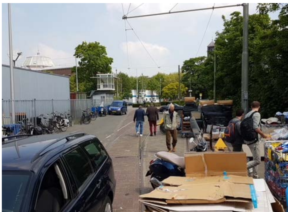
FIGURE 4 The Havenstraat area in 2017. An area with small trades and industries and a cycle route from popular Amsterdam South to the Amsterdamse Bos (one of the largest city parks of Europe at the border of Amsterdam and Amstelveen)

At the Marineterrein in Amsterdam (figure 5) things went differently. This inner city land came free for redevelopment after the Dutch army decided to leave the area step by step. Because of the central location and the increasing housing shortage in Amsterdam, a strong pressure to develop quickly was present. But it was decided not to quickly make a master plan but to develop this area step