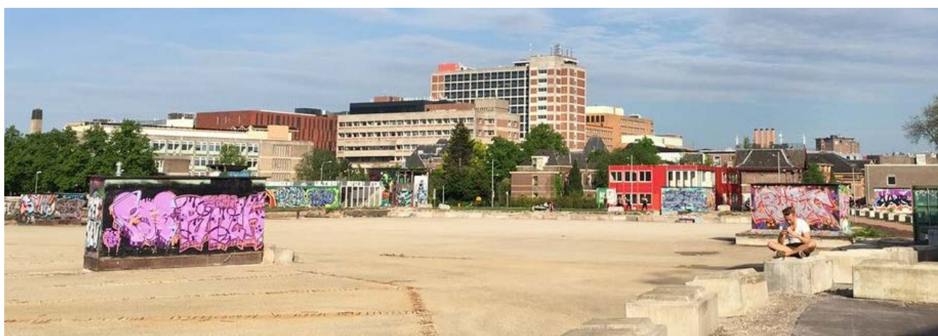
FIGURE 3 Temporary users of the Ebbingekwartier in 2017: sea containers housed creative entrepreneurs.

a hotel, mid to high range housing units and some space for the local university (von Schönfeld et al., 2019). In essence, the new stakeholders (entrepreneurs and creatives) were allowed to program the area temporarily but were not involved in how the restart of development would be. Inspired by the success of the Ebbinge quarter, the city of Groningen proceeded to incorporate the same strategy for the Suikerunie brown-field location as the next housing expansion location in the city. Again, temporary use of the location was granted to creative entrepreneurs, and it seems likely their input will not affect new development outputs and outcomes (De Nijs et al., 2020).